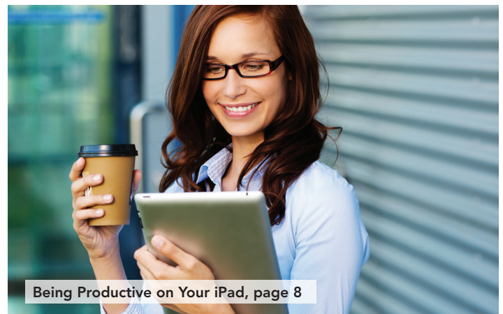
Being Productive on Your iPad, page 8