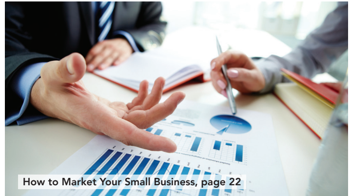
How to Market Your Small Business, page 22