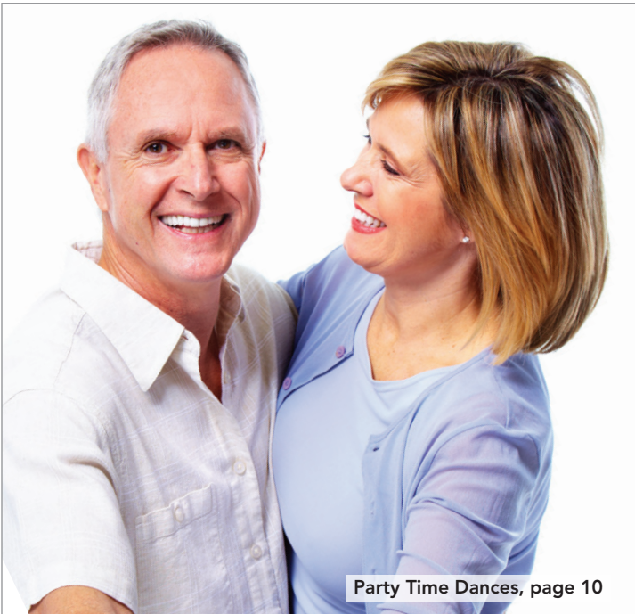
Party Time Dances, page 10